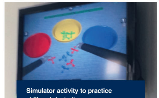
Simulator activity to practice skill and dexterity.